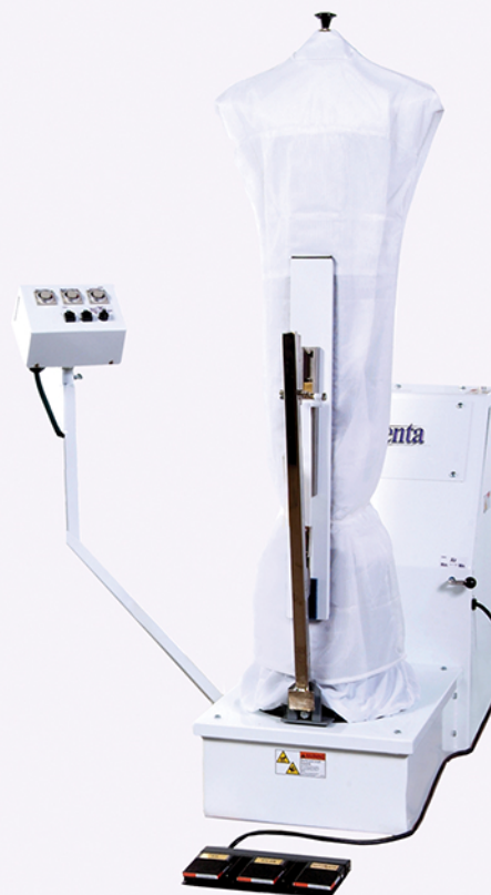
604AFL Form Finisher