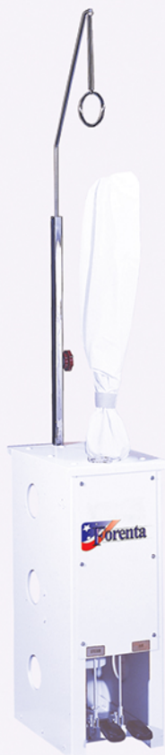
81SF Sleeve Finisher