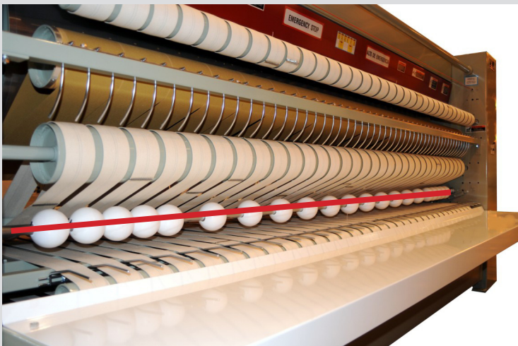
(OSB Has Been Eliminated From The Front)

The OSB provides a crisp and smooth primary fold. The OSB system keeps the linen tight as the IFC or IFCS makes the primary folds.