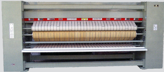
Model 3600 Ironer